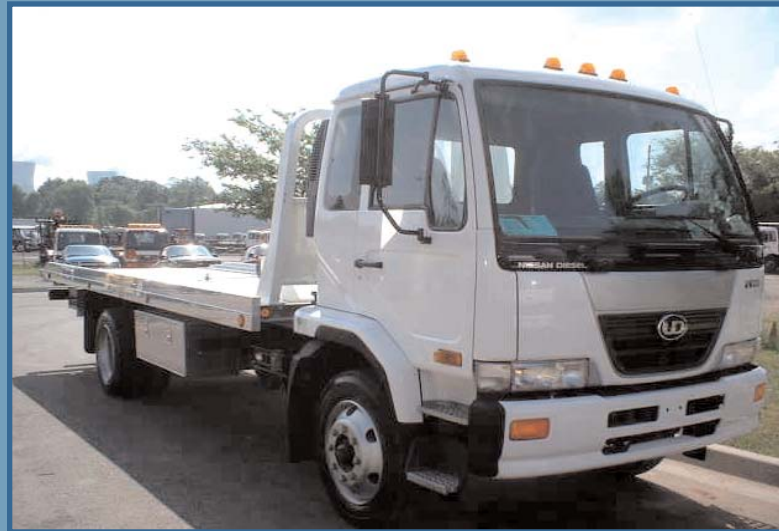
*UD2600 shown here with dealer installed optional equipment.