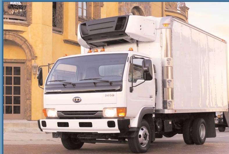
*UD1400 shown here with dealer installed optional equipment.

GAWR 5,360 lb. Rated Axle Capacity 6,170 lb. Axle Type "I" Beam Suspension Semi-elliptic leaf springs Shock Absorbers Double acting, telescopic type