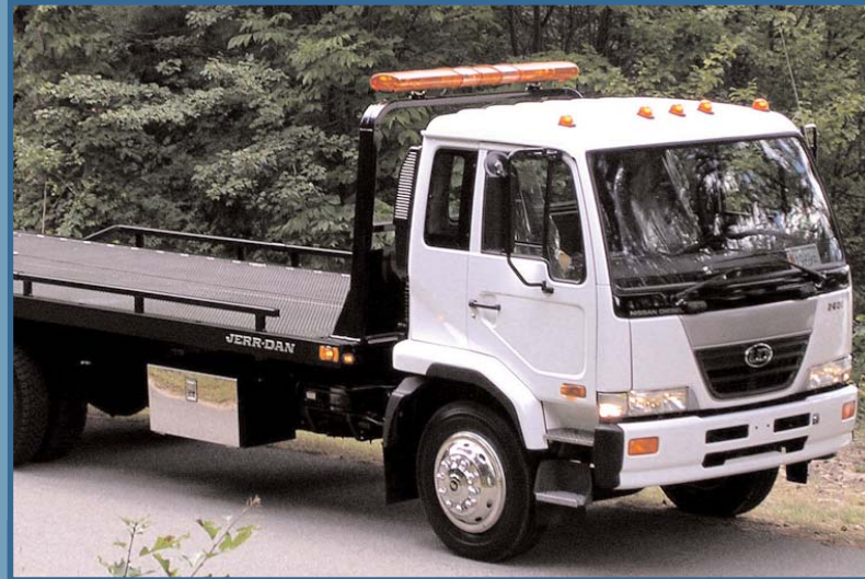
*UD2600 shown here with dealer installed optional equipment.

*Gross payload capacity equals GVWR minus chassis weight. Installation of specialized equipment or bodies may require frame reinforcement. **Wheelbase selection should be based on specific weight distribution. ***Typical body lengths assume water level load (no specific consideration for driver, passengers, or fuel) to maximize GVWR. Addition of ancillary equipment such as lift gates and refrigeration units not considered in calculations.